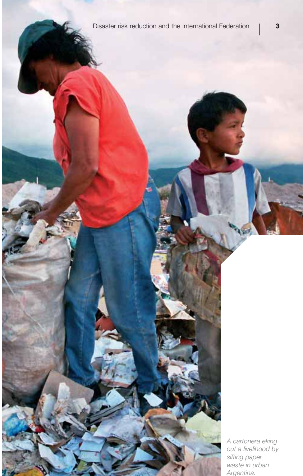
A cartonera eking out a livelihood by sifting paper waste in urban Argentina.

“Natural hazards are a part of life. But hazards only become disasters when people’s lives and livelihoods are swept away. The vulnerability of communities is growing due to human activities that lead to increased poverty, greater urban density, environmental degradation and climate change.”