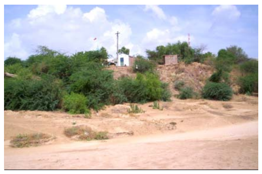
Hanumannagar slum in the North of Kheda. AIDMI provided livelihood relief, shelter material, communal toilets separately for men and women, a washing and bathing place, a community water tank, road, trees and established a community resource centre as well as an insurance scheme.

During the flood of 2006, many people obstructed their neighbourhood or