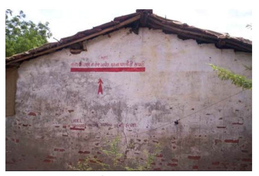
Indiranagar slum in the West of Kheda. The thick line above the arrow indicates the flood level. In this slum, AIDMI provided support for livelihood, shelter, road, workshed and drainage building. Affected people were covered under a disaster micro-insurance scheme.

The city of Kheda is surrounded by the Shedhi and Vatrak rivers on the west, south and east side. During the monsoon season, many smaller rivers downstream also feed water into Shedhi and Vatrak rivers, causing the water level downstream to rise. The water that is flowing upstream of these little rivers is thus blocked. Therefore, Kheda City can become flooded when not even a drop of rainwater falls onto it. Especially lowlying areas on the riverbank are prone to flooding. In addition, one small low-lying area in the west of Kheda is vulnerable to flooding. The chief officer in this city emphasised that floods are very different from each other. In 2005, there was only one flood but its' magnitude was very high. In 2006, there were six much smaller floods; however, these floods caused more havoc and damage than the flood of 2005. Hence, here we have two very important characteristics of floods: intensity and frequency.