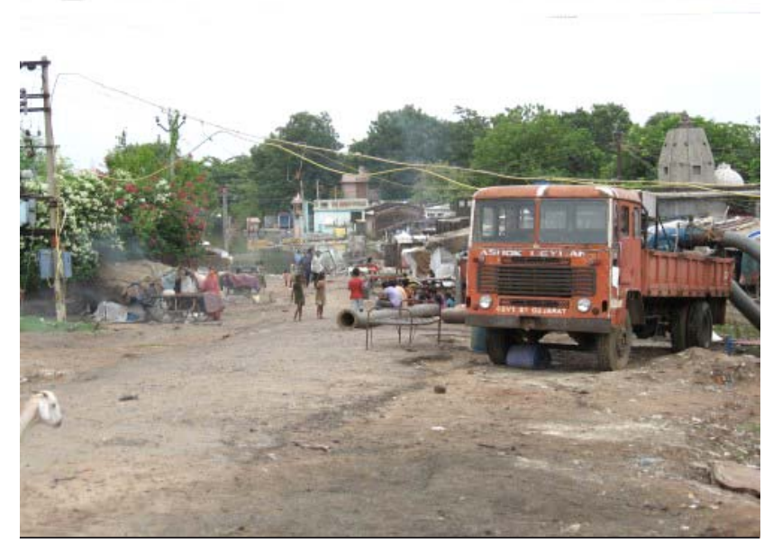
Dabbavas Thakorvas slum in Nadiad. Here, AIDMI established community resource center and provided livelihood support and insurance scheme.

Medicines are stocked disinfection powders are ordered. Pumps are ordered and old ones repaired. After the flood of 2006, the construction of a storm drain in Nadiad began and is now almost finished. In this way, it will be possible to drain floodwater out of the "saucer" of Nadiad. At the beginning of the monsoon season, a control room in the city itself is established. Information about rainfall, water level at dams and weather forecasts are updated here every 2 hours. In case of emergency, the local government has two satellite telephones; through this, communication is possible when land and mobile connections cannot be used. Further, a fire brigade is