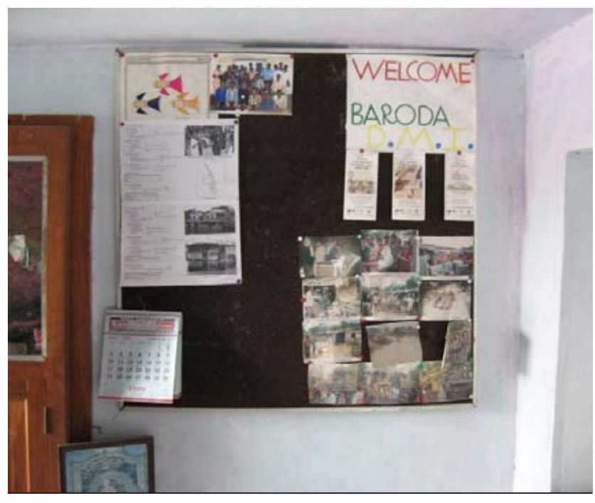
The community resource centre (CRC) in Aarab no Takiyo slum, Vadodara. Here, the community can discuss problems and have meetings with AIDMI teams. Also, the CRC is used as a small school to educate children who cannot attend primary school. However, this is not a substitution of primary education.

Considering the long delay in the arrival of relief, this understandable. Further, in all cities, all interviewed people carried on with the same livelihood activities after the flood though in many cases income dropped by about 30%. This had a large impact since incomes before the floods were just enough to meet basic needs. Also, all interviewed people continued to live on the same location after the floods. In Kheda, about half of the people have outstanding loans of between Rs. 4000-50,000/-. In Vadodara and Nadiad, very few people in the slums had outstanding loans. After the floods, most people invested in their houses and needed equipment for their livelihoods.