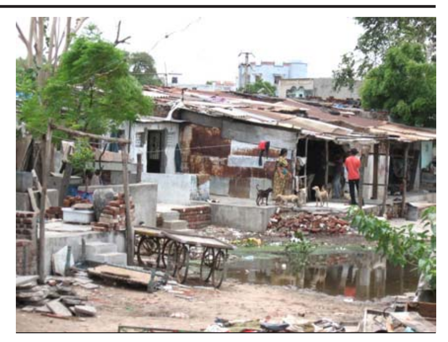
Aarab no Takiyo slum in Vadodara. The slum is located near two large ponds that often overflow after heavy rainfall.

We can conclude that again geographical characteristics are important. The geomorphologic aspects of Vishwamitri River cause the water level to rise, and a part of the solution to prevent Vadodara from flooding is to deepen and widen the Vishwamitri River. Also, trash forms one of the biggest problems during floods since it will block drainage lines as it is transported by