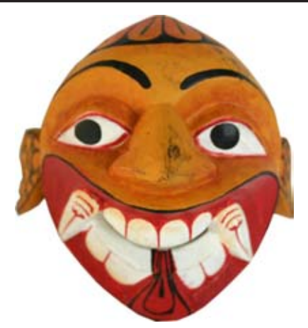
From international perspective to local tradition.

The ADPC wants to increase the safety of communities by implementing programmes and projects that reduce the impact of disasters in Asia. ADPC activities include the strengthening of institutional arrangements, spreading and exchanging knowledge on disaster risk management and raising awareness.