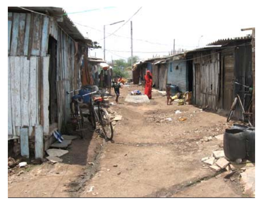
New Ranchhodnagar slum in Surat. This slum was affected by 2005 and 2006 floods. AIDMI provided livelihood support, insurance and established a community resource centre.