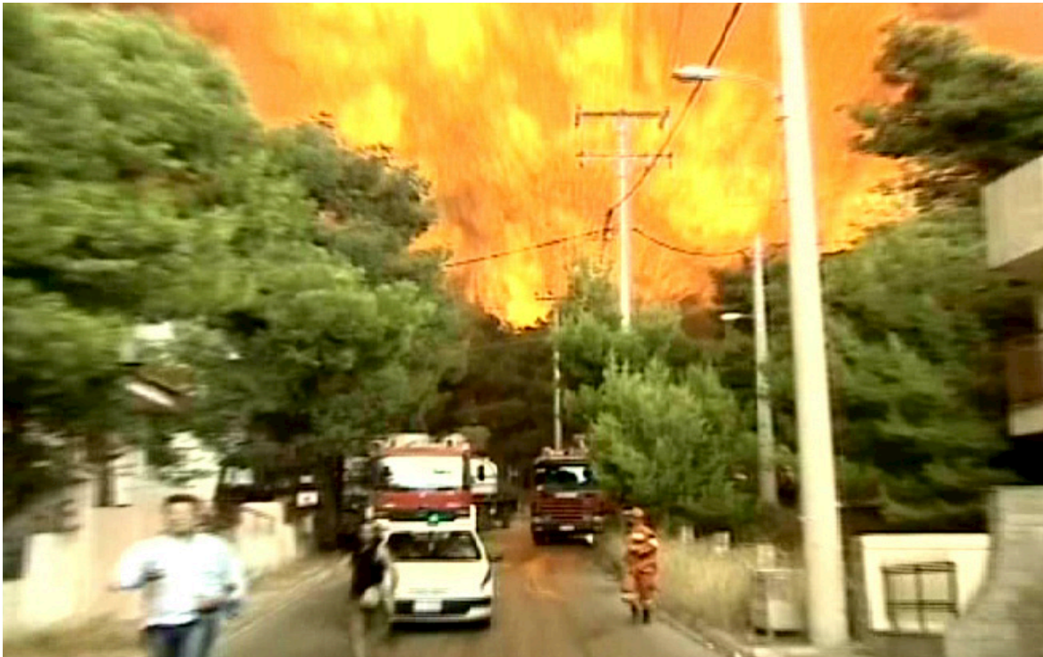
Figure 1 - Wildfire burning at the Wildland-Urban Interface

Wildfires also affect the ecological functioning of many ecosystems, as they partially or completely burn the vegetation layers and affect post-fire soil and vegetation processes such as soil erosion, debris flow, flooding and vegetation recovery. 8