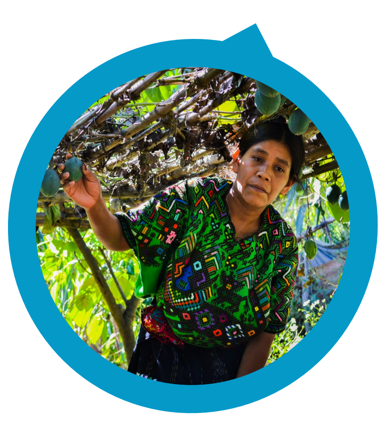
Photo: Tapexcos, indigeneous table like structures, were used to help improve and make safer the production of granadilla and make it safer.

As this case study was being finalised, PFR partners were preparing for a final Global Conference in October 2015. The PFR Alliance is coming to a close at the end of 2015 and the group will transition into an advocacy mode, working to influence policy and practice in ecosystem management and CCA. Bio-rights has been applied to other countries by PFR partners and the Global Conference will feature learning from these cases; it is likely that the advocacy work of the PFR Alliance will also promote the further application of Bio-rights.