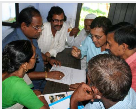
Oriented participants were busy in preparing school risk assessment through group exercise.

Following are some of the non structural mitigation measures found