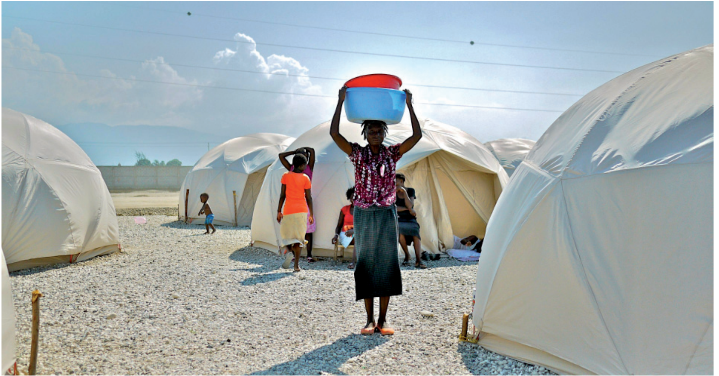
One of the first planned transitional settlements, Santo 17, in the town of Croix-des-Bouquets, Haiti, was officially opened on 13 March 2010. It occupies 4.5 hectares and is expected to shelter 1,400 displaced individuals. Zones 1 and 2 of Santo 17 have (as of 26 March 2010) 130 family tents provided by IOM.