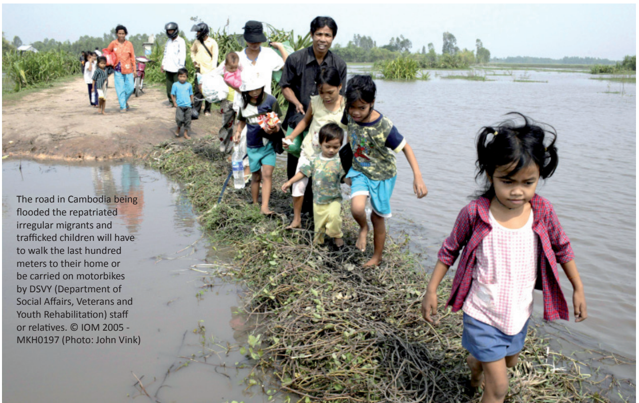
The road in Cambodia being flooded the repatriated irregular migrants and trafficked children will have to walk the last hundred meters to their home or be carried on motorbikes by DSVY (Department of Social Affairs, Veterans and Youth Rehabilitation) staff or relatives.

For more information on IOM's activities in the areas of climate change and the environment, see the relevant map and the Compendium of IOM's Activities in Migration, Climate Change and the Environment available at: http://www.iom.int/Template/gmaps/migration_environmental/