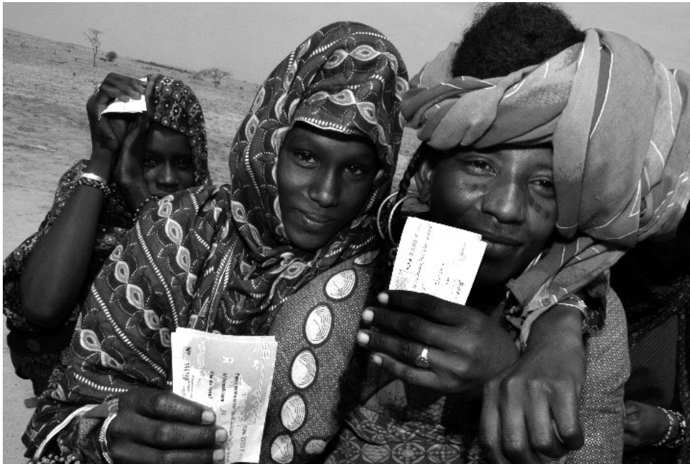
Vouchers for food in Niger, a new approach to relief.