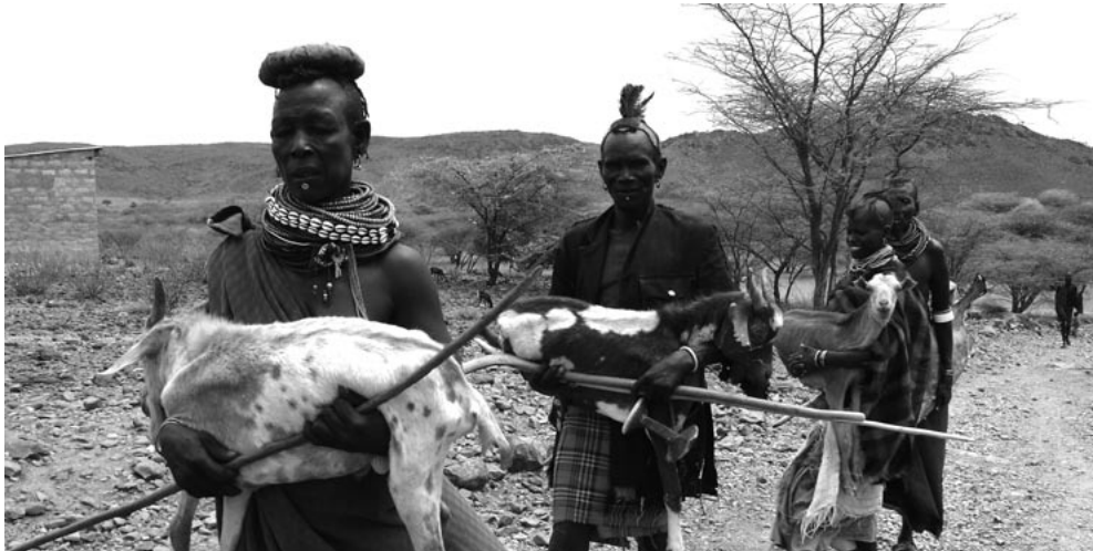
People bringing their weakened animals to an Oxfam destocking programme.