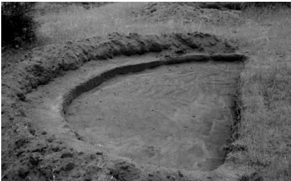
Half-moons, Niger.

Aid agencies, like Oxfam, working in Niger, have pioneered new responses to drought – such as calls for less foreign food aid and more direct transfers of cash vouchers into people's hands to enable them to buy the local food that is available on the markets. To help in the long term agencies are working with local non-governmental organisations like JEMED, a partner of Tearfund, to trap rainfall and boost agriculture. Simple structures that capture rainwater – stone lines or earthen half-moon crescents, mini-dams and dykes – can give communities an extra three months worth of water per year.