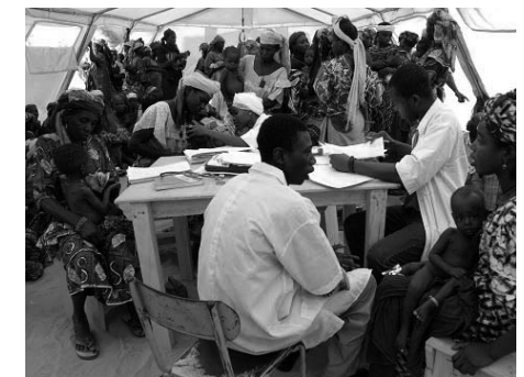
Emergency feeding, Niger, 2005.

Another factor is the developed world's failure to deliver aid predictably and in accordance with its commitments. Sahelian countries receive far less aid than other African countries affected by food crises. Annual aid to Niger, one of the world's poorest countries, actually fell from $60 per person in 1984, to $44.2 per person in 1992, $28.7 in 1998 and finally to a mere $12 per person in 2004. The UN has recommended that countries get $45 per head in order to have a chance of reaching the UN Millennium Goals by 2015. 15