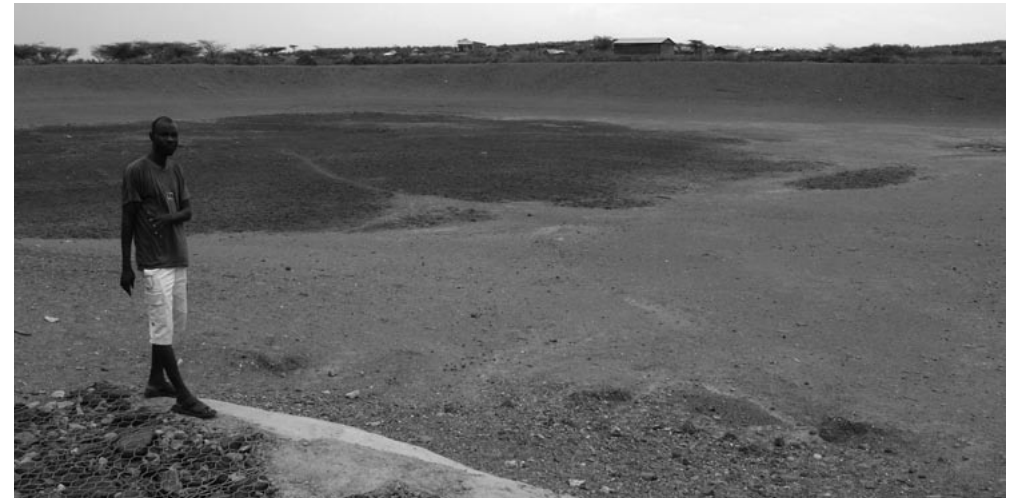
Dry waterhole, Turkana.