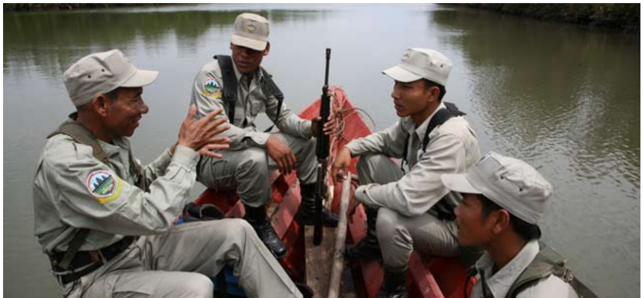
Forest rangers on patrol in Cambodia, S. Griffiths 2008.

reduce greenhouse gas emissions simultaneously through improving land use and forest management, developing biofuels, improving urban sanitation, decreasing air pollution, and improving water management. In the short-term, ADB will mobilize investments to address climate change concerns in water supply and sanitation in all of its Southeast Asian member countries. It will enhance investments in specific land and marine resource management projects in Indonesia and the Philippines to protect forests, fisheries, and coral reefs to address both mitigation and adaptation. In Viet Nam, ADB will invest in air pollution reduction initiatives which will have co-benefits for climate and health. ADB will also work with other donor partners to increase investments in sustainable agriculture to decrease greenhouse gas emissions from farming, while increasing livelihood security.