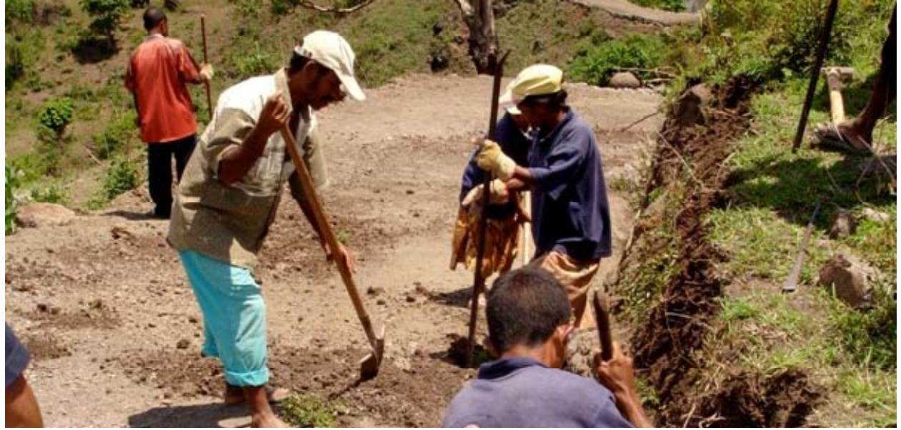
Improving roads in the Solomon Islands, R. Guild 2008.

In 2005, ADB's Pacific Department (PARD) adopted Guidelines on Adaptation Mainstreaming in PARD Operations .<sup>30</sup> The department has already identified possible modifications that will climate-proof ongoing projects and incorporate climate-resilient design for new projects. In the future, ADB will place much greater emphasis on adaptation, and on new assistance to capture the synergies between adaptation and mitigation, and between disaster risk reduction and climate change adaptation. In the Pacific the sectors where addressing climate-related risks is of highest priority are (i) infrastructure and human settlements, including