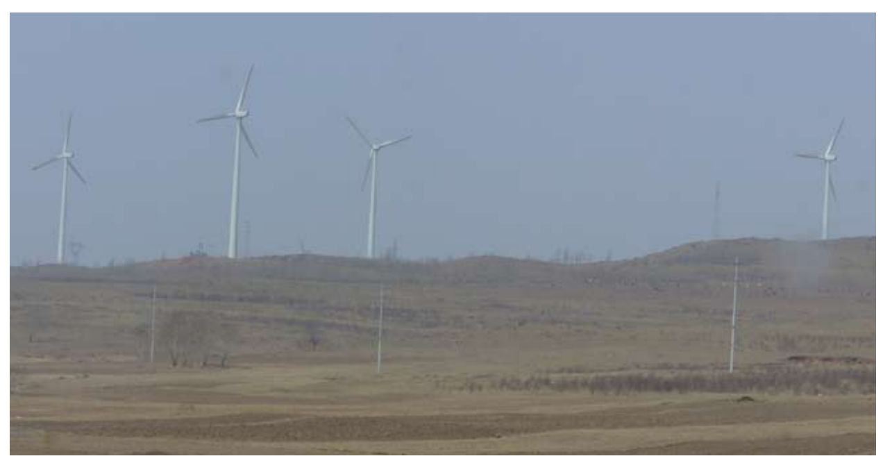
Zhangbei Wind Project provides clean energy in PRC.

ADB will invest in sustainable urban transport infrastructure in Ulaanbaatar in Mongolia and in selected cities in the PRC to minimize increases in CO<sub>2</sub> emissions from the urban transport sector. Urban investments will continue to promote low-carbon growth and improve environmental management in cities by reducing methane emissions in wastewater treatment, wastewater sludge management, and in landfill gas recovery as components of urban waste management, and where appropriate, formulate CDM projects. In partnership with the Clean Air Initiative for Asia and others, ADB will further increase investments—such as those planned for Gansu Baiyin, Guangxi, and Xinjiang in the PRC—that yield local health benefits and global climate benefits.