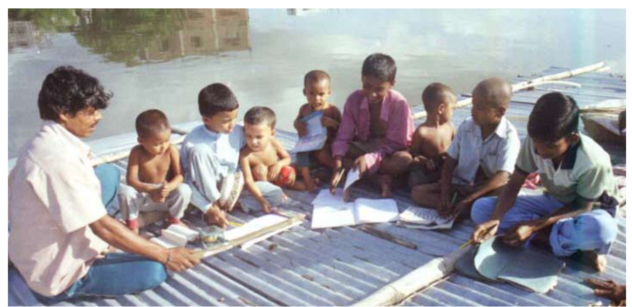
Despite flooding, education continues on rooftops in Bangladesh, ADB Photo Library 2008.

Agriculture. Along with development partners, ADB will support research and development of new varieties of crops and alternative cropping patterns, capable of withstanding extremes of weather, long dry spells, flooding, and variable water availability. ADB will also make investments to increase resilience of irrigation systems in India and Nepal where water shortages already have a devastating impact on rural livelihoods, and in Bangladesh where saltwater intrusion from sea-level rise will render existing cropping systems unproductive.