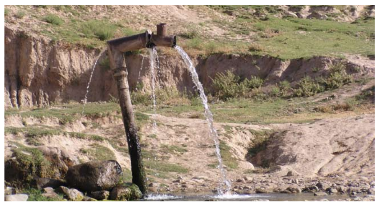
Irrigation system in need of upgrade in Central Asia, R. Everitt 2009.

Policy and institutional support. In Central Asian countries, the water–energy nexus is a key issue, with conflicting energy and irrigation needs and major international tensions. Integration and expansion of existing ADB regional projects in Central and West Asia can address these issues in the context of regional water and land resource management, while leading to multiple adaptation