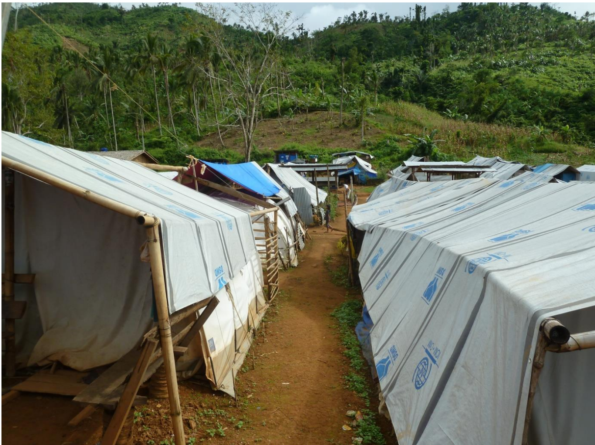
Image 1: Barangay Tatayan, one year after typhoon Bopha, New Bataan municipality, 4 December 2013.

The region of Eastern Mindanao was affected in 2012 by Typhoon Bopha (locally known as Pablo) which killed 1,146 (with 834 people still missing) and displaced 925,412 people. 13 Today, there are still 8,925 people staying in temporary shelters (See Picture 1). New Bataan lies in Compostella valley, a region that was devastated by typhoon Bopha (see map below). In addition, the region is a stronghold for the National People's Army, a 40 years old communist rebel group.