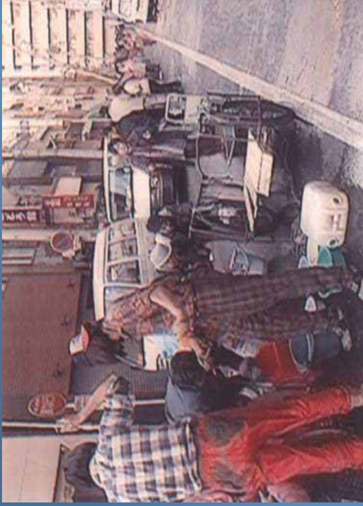
Fire fighting bucket brigade