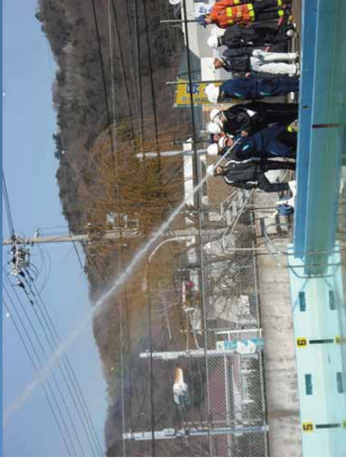
BOKOMI Junior teams